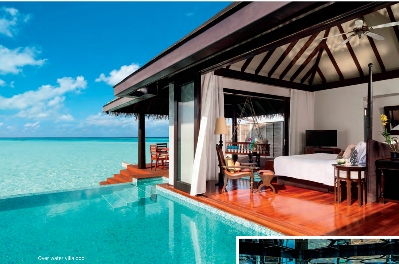
Over water villa pool

blacktip reef sharks, Triggerfish, Barracuda, and, of course, the ever-adaptable octopus. Just beyond the reef, the bottom of the ocean disappears into darkness creating a hauntingly beautiful scene.