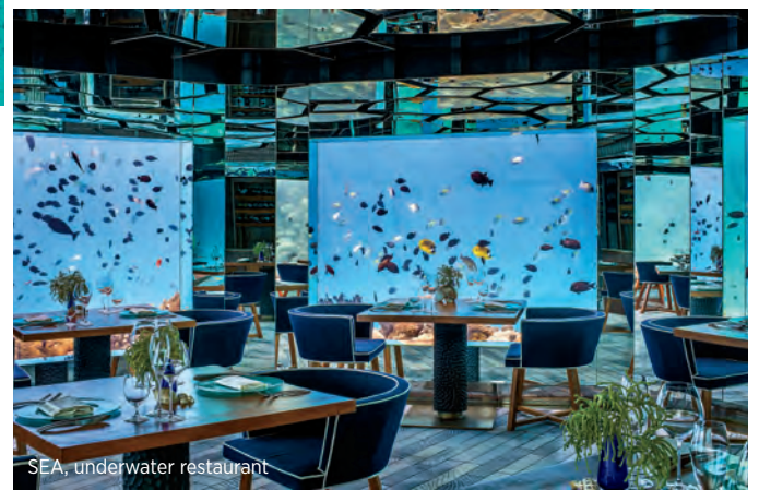
SEA, underwater restaurant

One morning for breakfast we descended below the ocean, walking down flights of stairs, through a beautiful underwater wine cellar, and into a