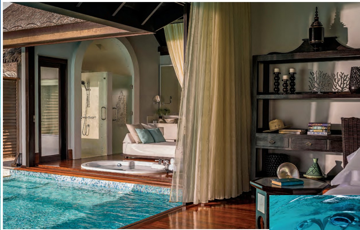
OPPOSITE PAGE: Aerial view of over water villas ABOVE: View from the bedroom of the over water pool villa RIGHT: Manta Rays in Hanifaru Bay BOTTOM: FIRE interior