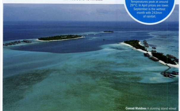
Conrad Maldives A stunning island retreat

The perfect time to visit is between January and March, with the latter being the hottest months. Temperatures peak at around 29°C. In April prices are lower. September is the wettest month with 243mm of rainfall.