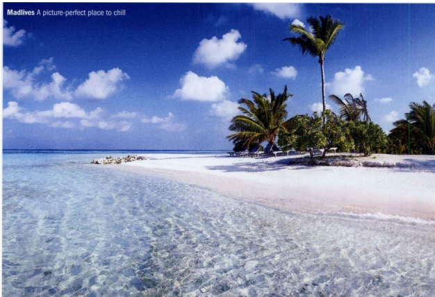
Maldives A picture-perfect place to chill