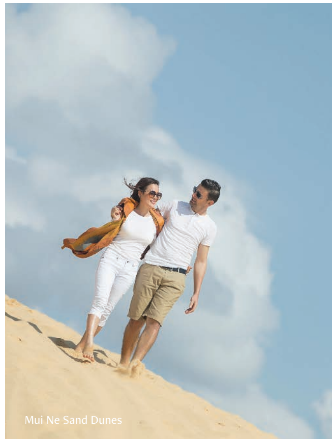
Mui Ne Sand Dunes