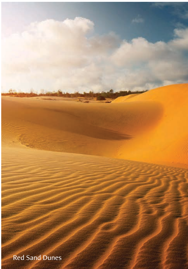
Red Sand Dunes