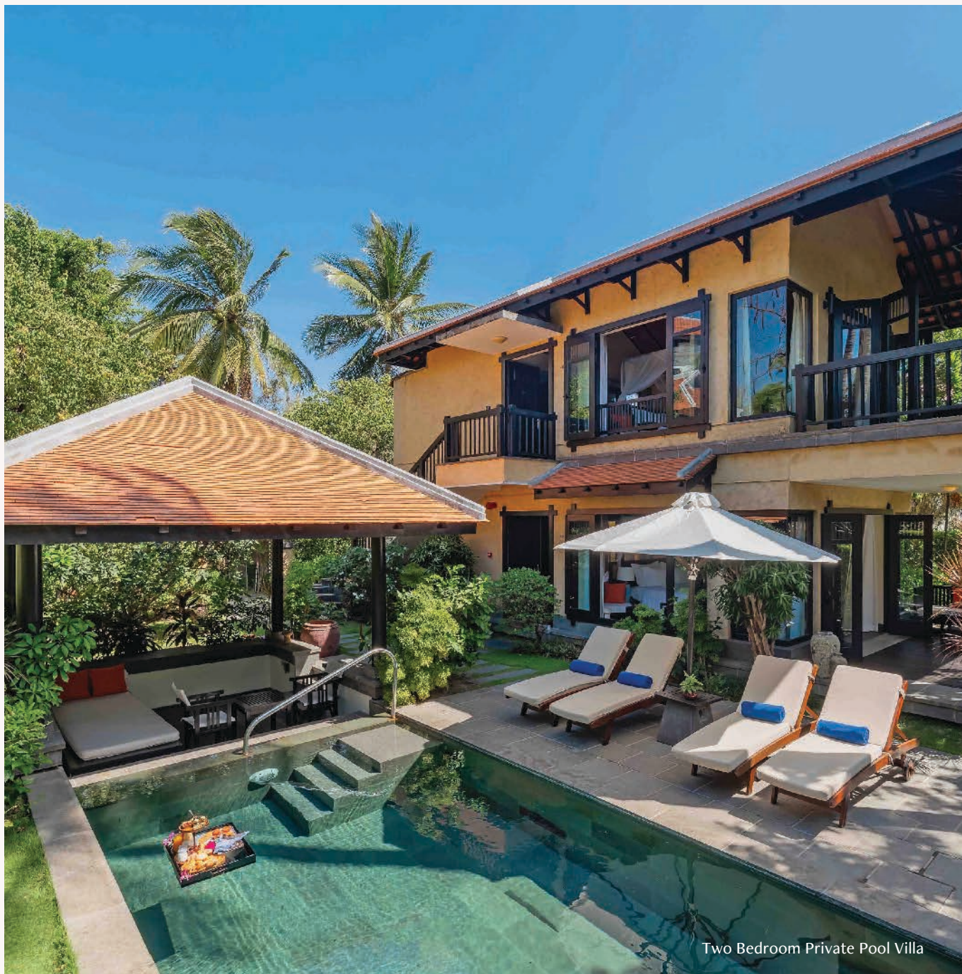
Two Bedroom Private Pool Villa