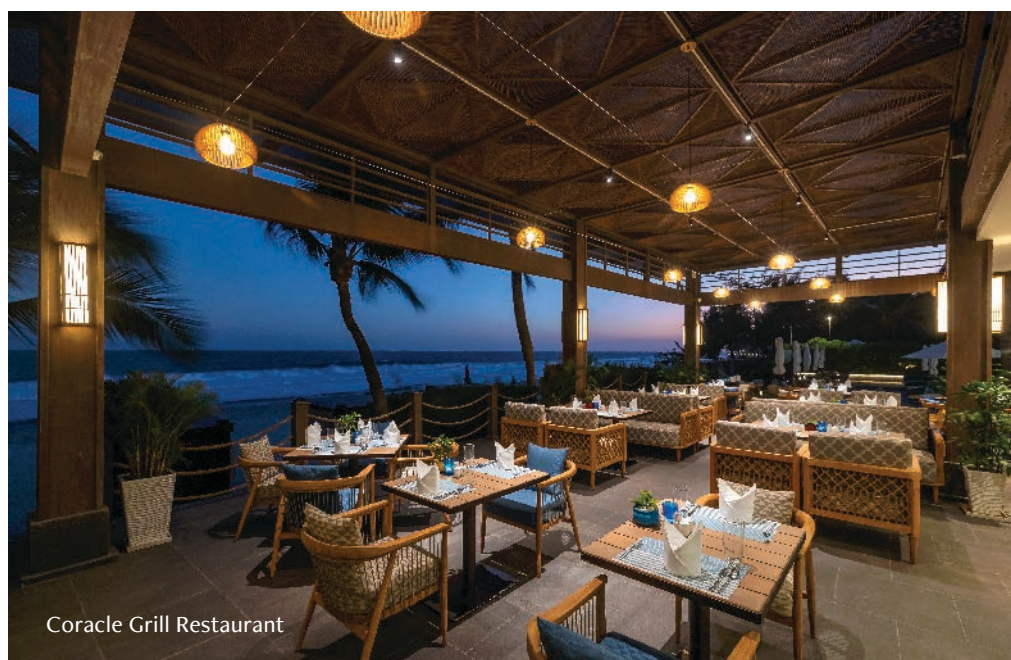
Coracle Grill Restaurant