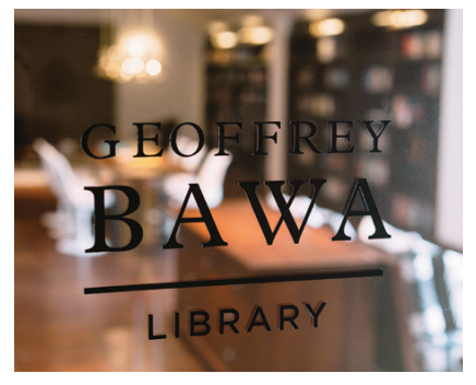
The resort features a Geoffrey Bawa library that imitates designs of the architect's residence

Despite the Roman inspiration and Dutch ceilings, local heritage informs Anantara Kalutara without tipping into kitsch, with Sinhalese accents enriching the interiors and imbuing the property with its strong sense of place.