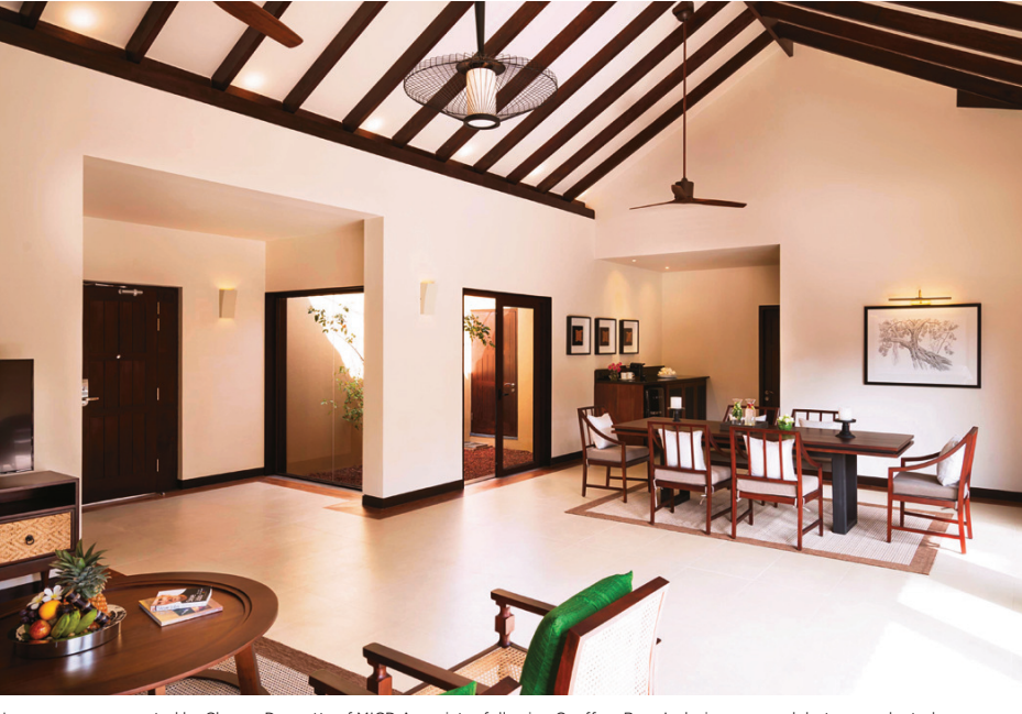
New rooms were created by Channa Daswatte of MICD Associates following Geoffrey Bawa's design approach but were adapted to contemporary hotel needs

The Sri Lankan Parliament building, commissioned in 1979, effortlessly combines Bawa's modernist, geometric leanings and the tropical space the building occupies: asymmetrical, interconnected pavilions rooted in