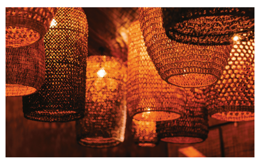
ABOVE Products reflecting local materials, crafts and heritage were used throughout the interiors as Sinhalese accents

century and a rubber plantation under the British in the next, the six-hectare Lunuganga is now a public garden and seasonal hotel after dozens of other incarnations. Fresh from law school, Bawa purchased the abandoned estate in 1949 and it was Lunuganga's sprawling main house, surrounding tangle of greenery and cool, serene lakeside position that inspired him to study architecture in London. An ongoing project for Bawa over the next 40 years, Lunuganga became something of a laboratory, a place where the influential architect would hone his craft and define his signature tropical modernism, a hybrid of his Architectural Association education and his home's monsoonal climate.