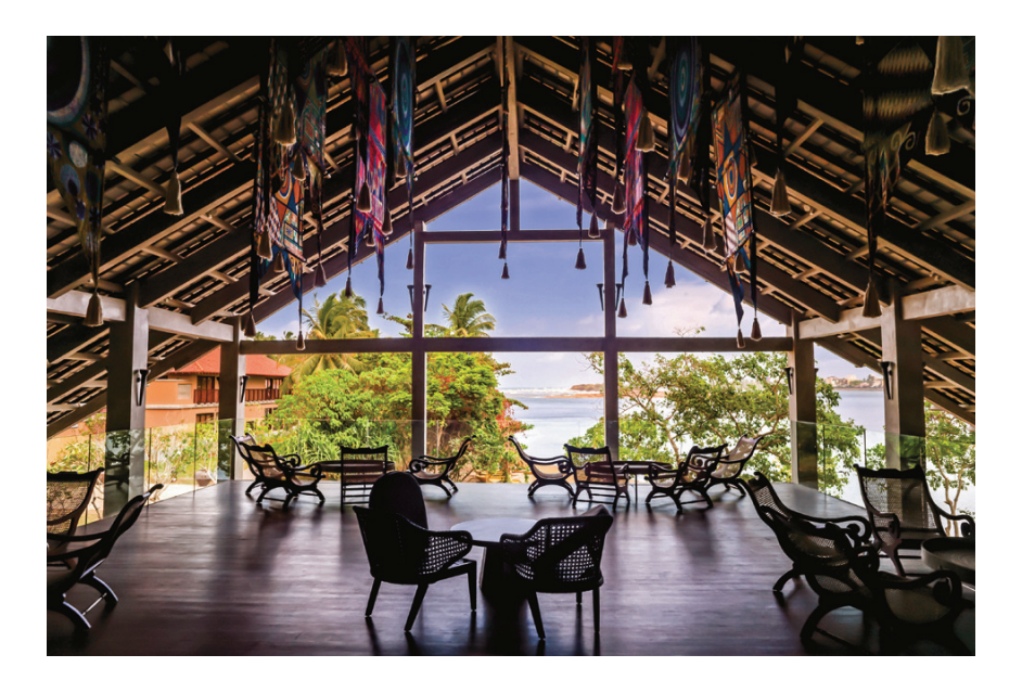
BELOW The Upper Deck bar of the pitched-roofed main building containing the Kalutara lobby and lounges provides views of both ocean and lagoon