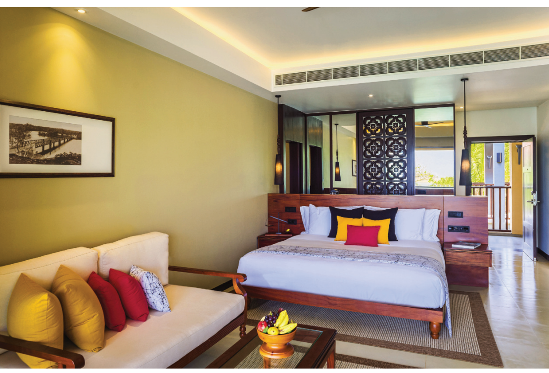
ABOVE Interiors of the villas at Kalutara by DDN Design employ natural materials, clean lines and vivid injections of colour using local textiles