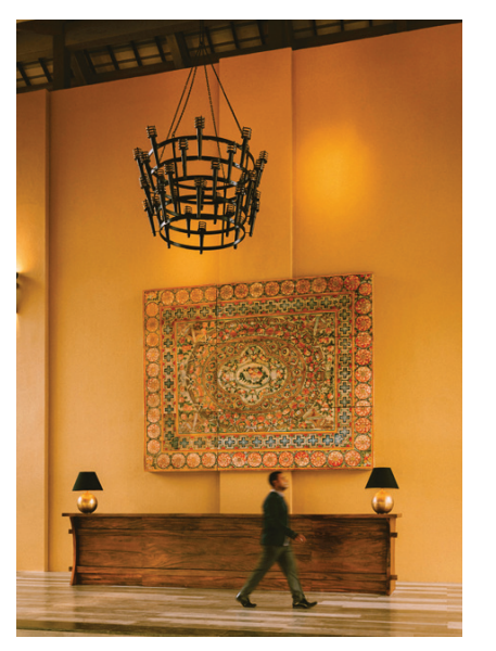
LEFT & ABOVE Local motifs and crafts with modern polish

The result is a perfect blend of colonial scale, historic inspiration and Sri Lankan aesthetics. With long corridors that recall a roman villa such as Hadrian's at Tivoli, and its discreet location, Anantara Kalutara's design means service and guest movement never crash into each other. It's complemented by typically Sri Lankan open pavilions, or ambalama, traditional resting spots for weary travellers, with natural light and ventilation spilling between the colonnades and open sides of common areas.