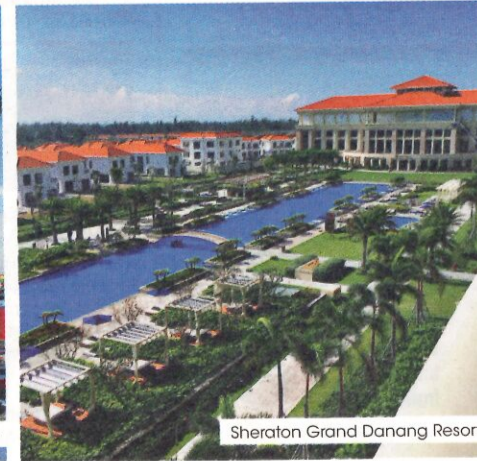
Sheraton Grand Danang Resort