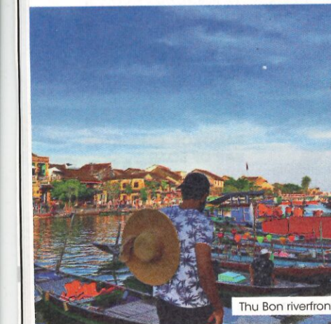
Thu Bon riverfront