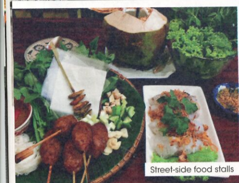
Street-side food stalls