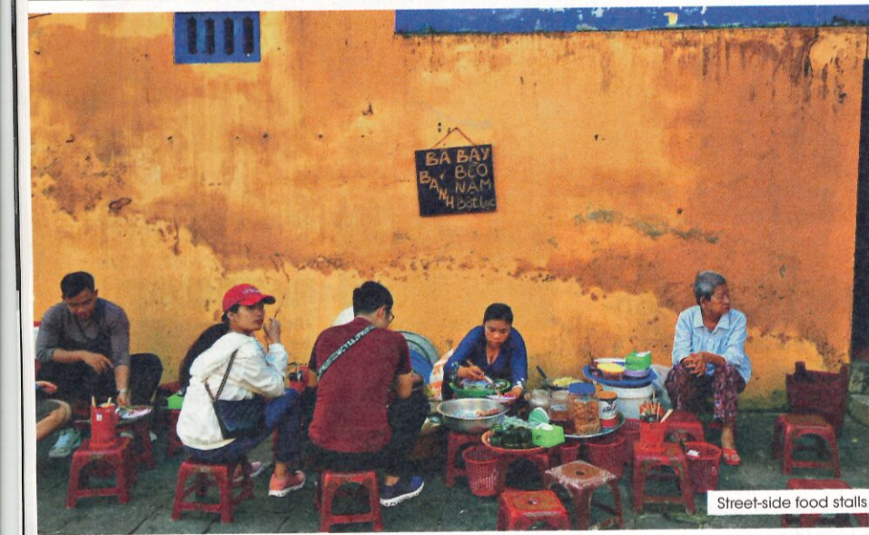
Street-side food stalls