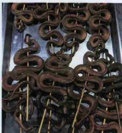
Clockwise from left: Sunrise at Angkor Wat; the many faces of Bayon temple; snake snacks in Siem Reap; Shinta Mani Angkor's main entrance

craftwork ranging from textiles to paintings. Many of the artworks pay tribute to the temples of Angkor, along with carved ornaments, lacquerware, textiles and other trinkets that make for charming souvenirs.